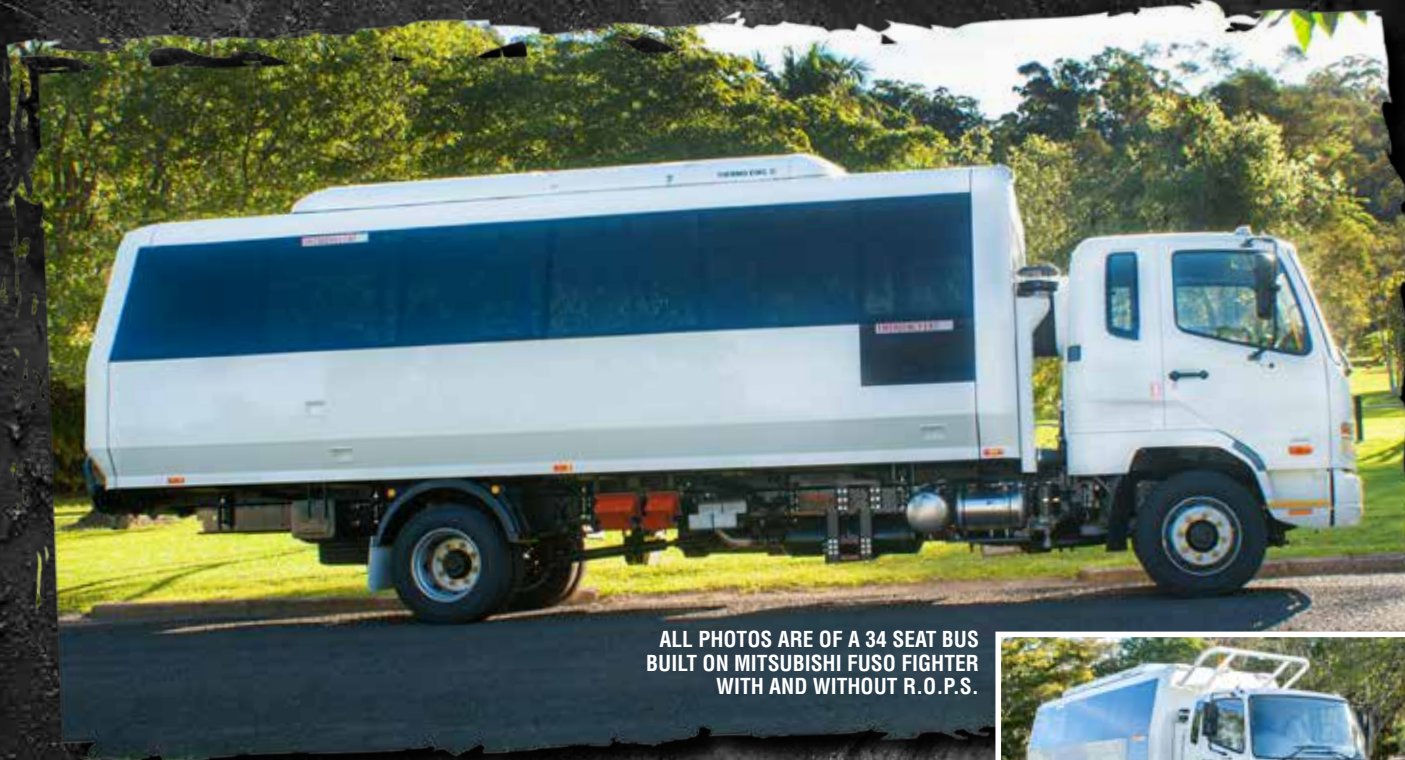
ALL PHOTOS ARE OF A 34 SEAT BUS BUILT ON MITSUBISHI FUSO FIGHTER WITH AND WITHOUT R.O.P.S.

ATW Buses can be transferred to a new replacement chassis once the service life of the truck has been reached. All internal and external panels are of composite construction and are extremely tough, easy to repair and even easier to maintain. They are typically hosed out inside to be cleaned.